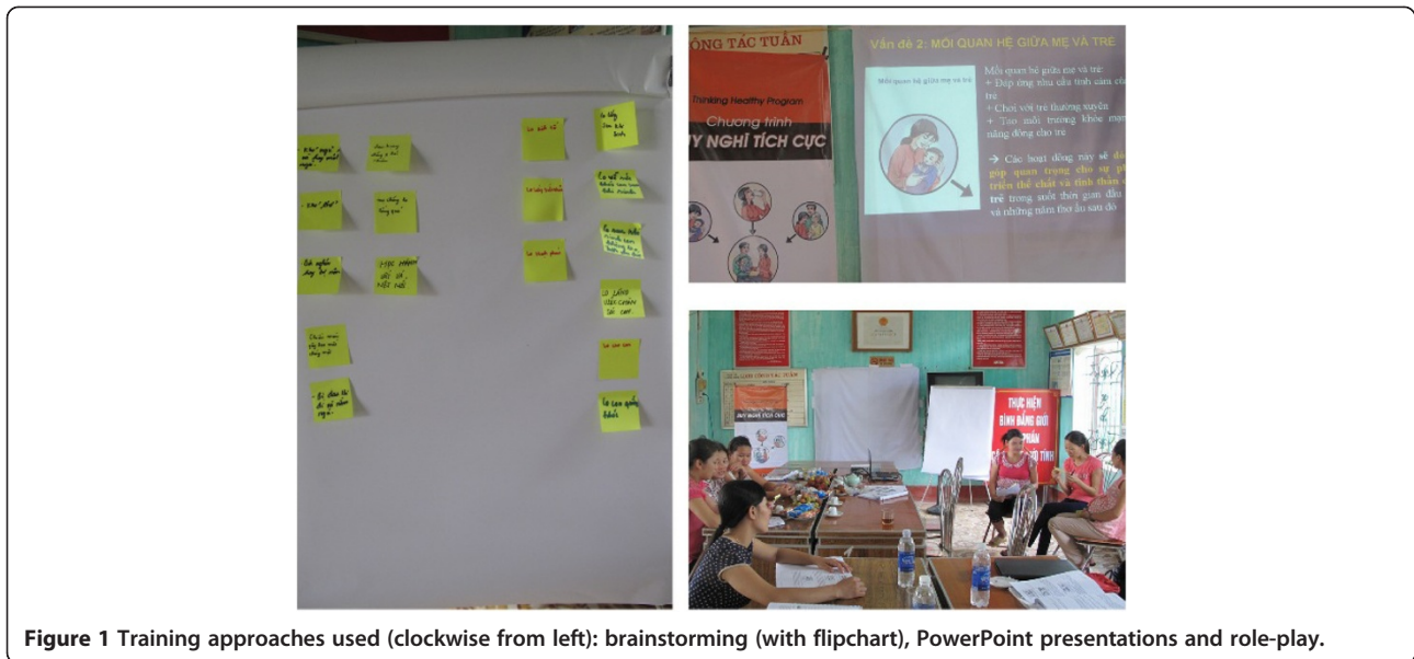
Figure 1 Training approaches used (clockwise from left): brainstorming (with flipchart), PowerPoint presentations and role-play.

materials provided in the THP to ensure that these were relevant to Vietnamese settings. These included changes to depiction of appearance (head covering is normative for women in Pakistan, but not in Vietnam) (see Figure 2), the use of brighter colours, and alteration of descriptions of cultural practices such as the “first month celebration” to fit local traditions and to remove suggestions that permission from a male family member was required in order to be able to leave the household.