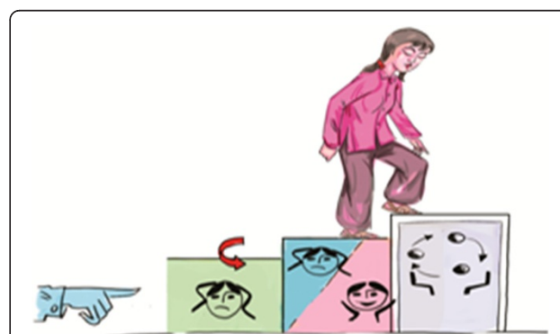
Figure 3 Image illustrating the three steps of the Thinking Healthy Program approach, but suggested to require modification for Vietnam to represent more optimistic body language.

first is that participants were not experiencing common mental disorders; their psychological functioning was in the non-clinical range and therefore there was limited potential for change in this domain. Second, the length of the field test (one month) was significantly shorter than that of the actual THP program (twelve months) and might not have been long enough to generate change in mental health. Third, only a quarter of the modules was delivered in the pilot, and therefore it might not have constituted an adequate 'dose'. Fourth it is possible that participation in the program increased